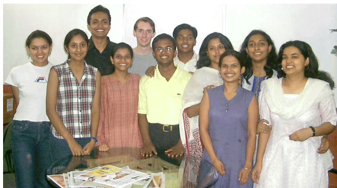
Summer Interns 2002

May-July 2002 : Eleven college students worked with us as research interns in Delhi and three in Bangalore and Kolkata during summer 2002. The projects they worked on are License & Livelihood, Bureaucracy, State in Religion, The Plastics Conundrum, CNG: Economics Vs Environmentalism, Poverty Alleviation Programs, Directed Credit, Big Industry Before Independence, New Public Management: Garbage and Public Transport.