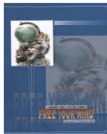
Free Your Mind