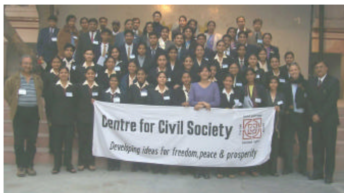
Economics in One Lesson, Sunbeam College, Varanasi

The graduates of the LSS routinely invite us to their colleges to organise a one-day program for larger audiences (70-200 participants). This Seminar covers core issues like Population: The Ultimate Resource, New Public Management, Private & Political Markets, Environment: The Tragedy of the Commons, Role of Greed in Society, Economic Freedom & Prosperity. Most of the institutes where we have