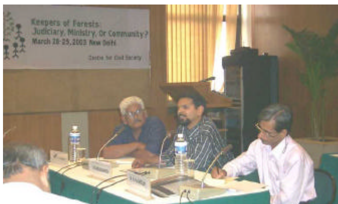
Panel discussion at the Forestry Conference