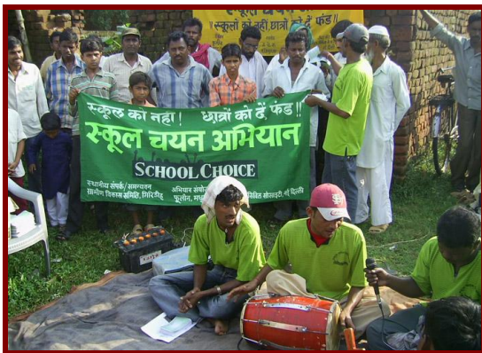
Street Play in progress in Jharkhand, to advocate the School Choice Campaign