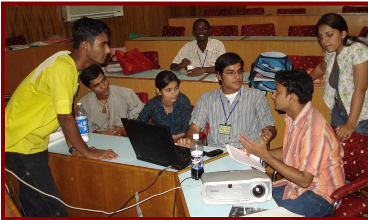
Discussions during the LSS, Delhi, October 2007