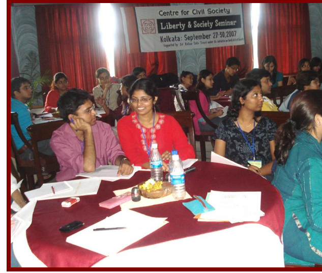
Kolkatta LSS, session in Progress