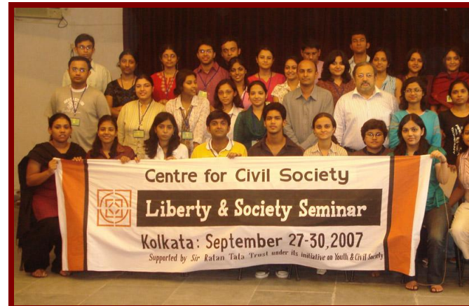
The participants at LSS, Kolkatta, September 2007