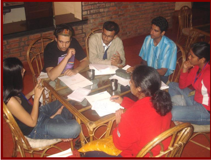
LSS Session in Progress, Bangalore September 2007