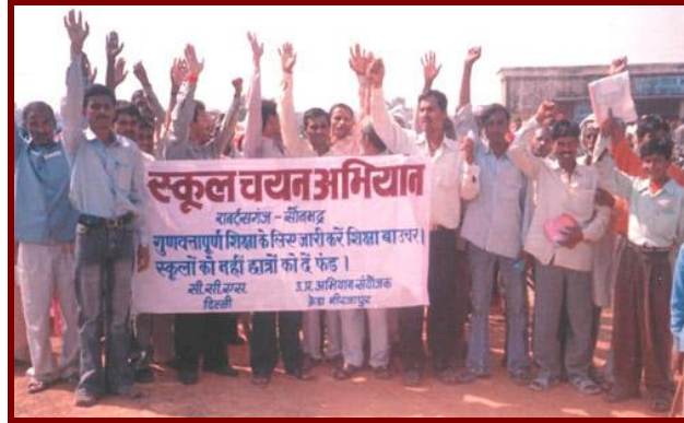
A citizens rally in UP, demanding funding for students and not schools