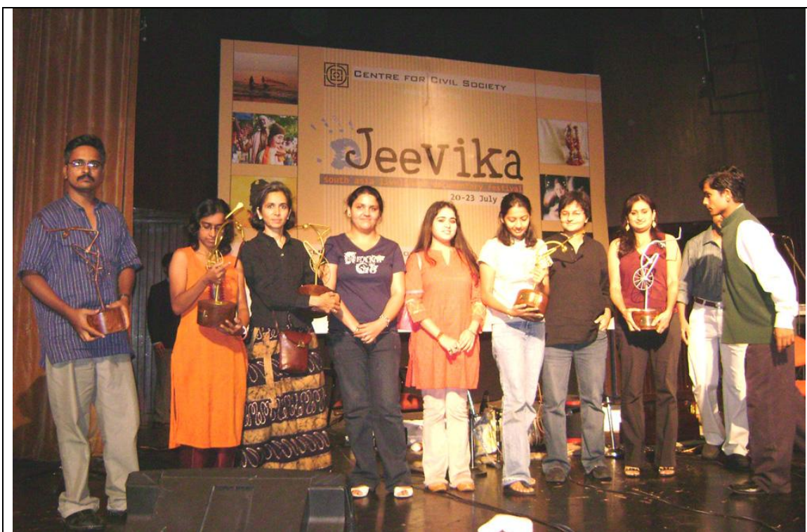
Winners of Jeevika 2007

To maximize the impact of the Jeevika documentaries, CCS disseminates copies of the winning films to educational institutes and development organisations all across South Asia. Jeevika films have also been traveling to various cities of Mumbai, Chennai, Ahmedabad and Los Angeles apart from Delhi.