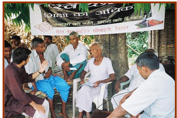
Discussion with the village seniors on the School Choice Campaign, in Bihar